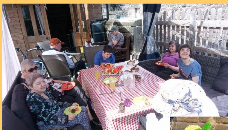
How amazing is our Alien themed food!!

We had soooo much fun in our garden space this Summer from Cocktail afternoons to Seaside themed parties, Games days, Birthday parties and Afternoon Teas and a virtual trip to Mars!. We were so eager to see our Harrogate Chocolate Factory café open that we turned the Briardene cabin into a temporary coffee shop to put us on!