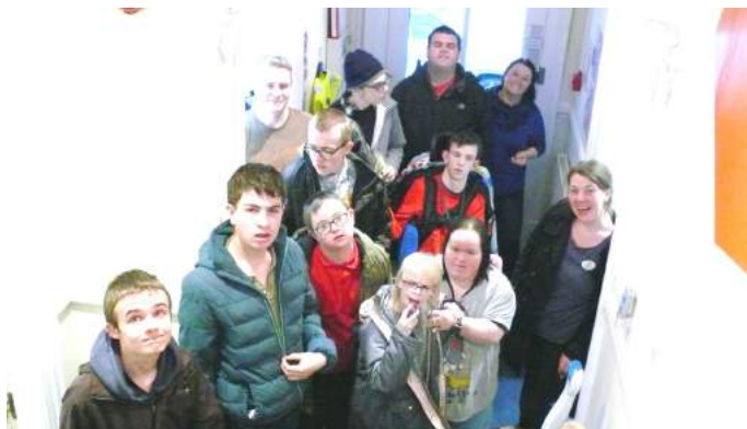
Springwater and HS4LC staff and students after fun morning

Sixth formers from Springwater School enjoyed taster sessions as they explored options for future learning when they visited 9 North Park Road on 22 nd November.