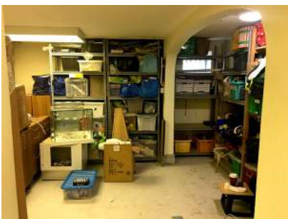
Basement before clear-out