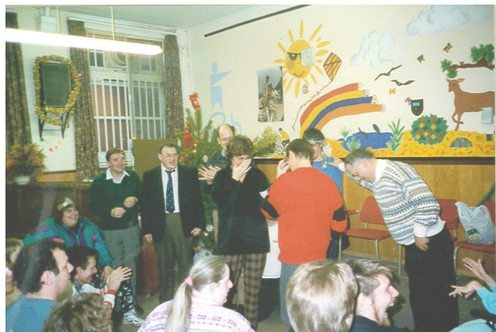
Then... The Junction at Mornington Terrace

Learners who have been at HS4LC for a long time had a blast from the past when we moved to 2 Mornington Terrace for sessions on Mondays, Tuesdays and Fridays in late October. The move is only temporary, to allow the builders to complete our new basement more quickly. HS4LC, then called The Junction was based at Mornington Terrace until June 2011 when we moved to 9 North Park Road. Here are some ‘then’ photos, taken many years ago and ‘now’ photos taken recently. Do you have memories of being at The Junction?