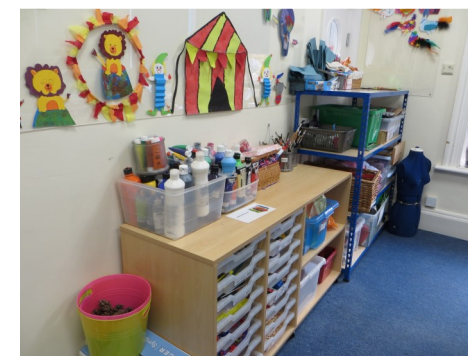
Our craft rooms have been tidied

70 students had their say about coming to the HS4LC when they filled in our annual Client Survey in March. Most of you are very happy with the staff, courses and building. You like the staff, calling them "helpful", "kind" and "friendly". Most of you like the building and think that we have enough space. Comments about the courses include "It's good and interesting" and "if I couldn't come here I would stay at home and get bored".