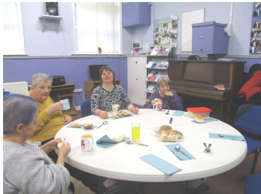
Now... HS4LC at Mornington Terrace