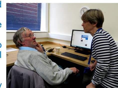
We will try harder to listen to you

Thank you to everyone who filled in our survey. This is your centre and we need your suggestions to make sure your time at HS4LC is happy and fulfilling.